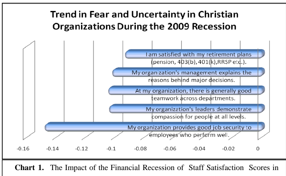
Chart 1. The Impact of the Financial Recession of Staff Satisfaction Scores in